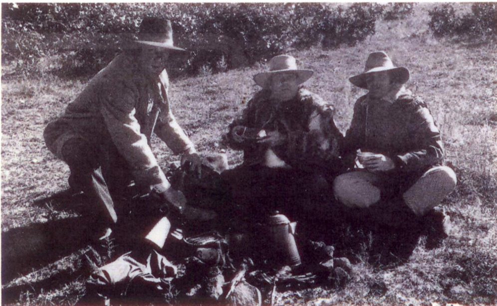
Hower, Woods and Lincoln

A final explosion provides the transition out of the tag line "The Channel Eight News Guys..... Revolutionary."